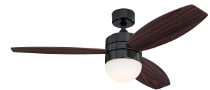
Reversible Walnut Finish Blades